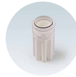
Sinter filter for membrane drying unit