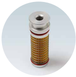
Air intake filter for compressor units

Visit our overview website to help you find the right filter: https://www.duerrdental.com/produkte/druckluft/material-zubehoer/filterauswahl/