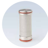
Virus bacteria filter