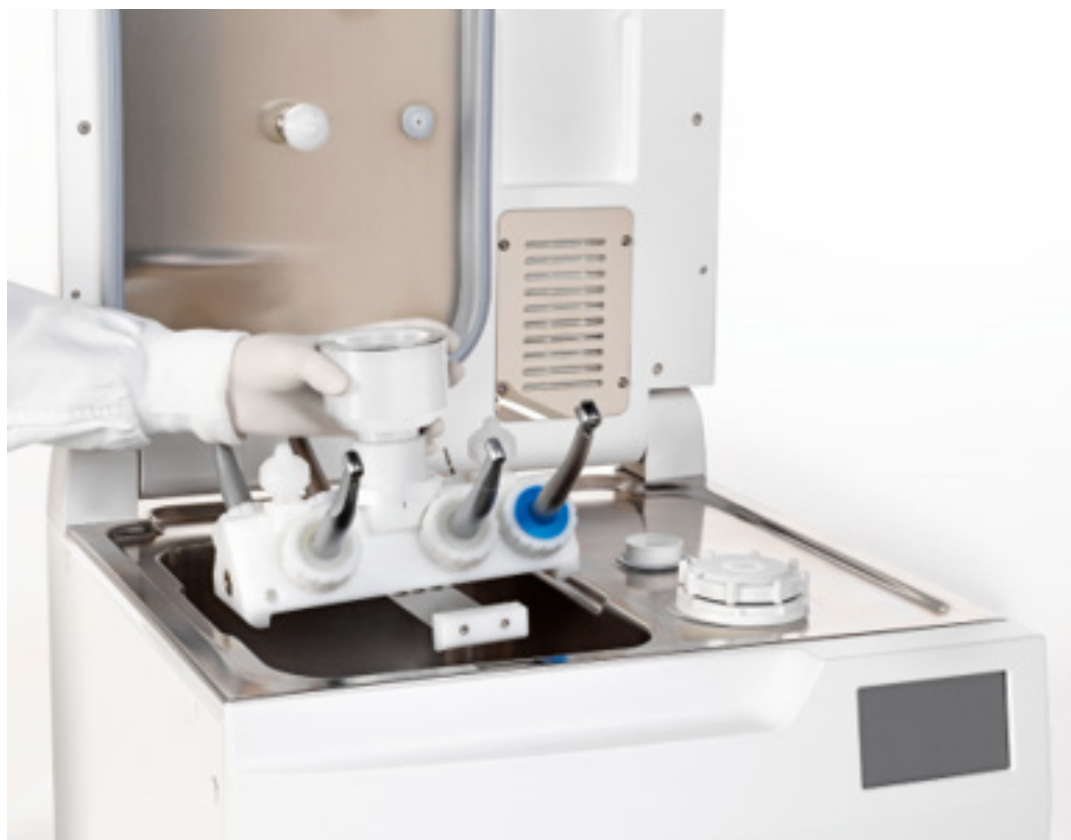
Attachment easily removed.

The Handpiece Attachment is compatible with all Mocom Tethys H10+ units, including those that have already been installed, a simple firmware update is all that is needed.