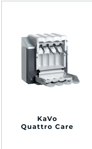
KaVo Quattro Care