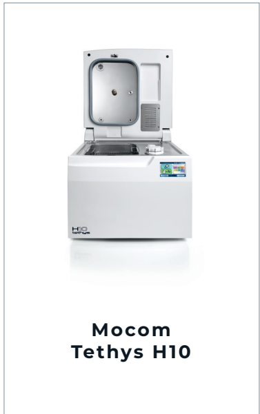
Mocom Tethys H10