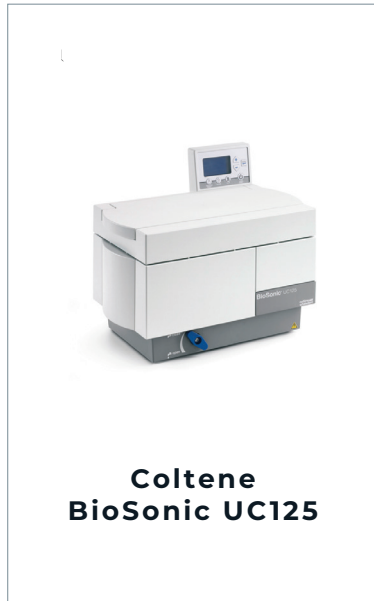
Coltene BioSonic UC125